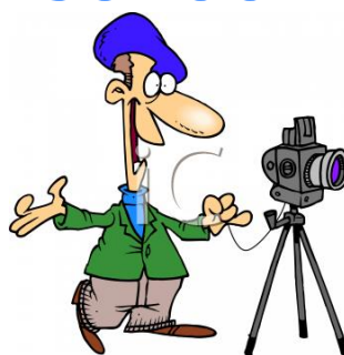
Photo Day is on 6 June 2018

Photo Envelopes Sent home with your child today