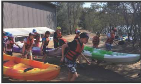
Canoeing was heaps of fun on Narrabeen Lake.