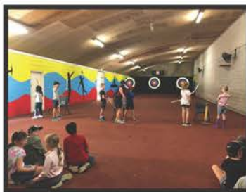
Indoor and outdoor archery