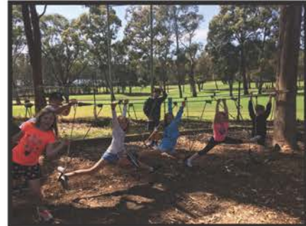
Low ropes course was lots of fun