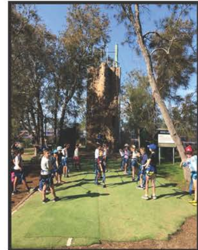
Everyone enjoyed the rock climbing - albeit with varying success